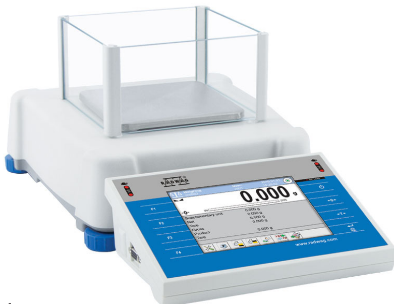
PS 3Y, d = 1 mg

Professional weighing under laboratory and slightly challenging industrial conditions