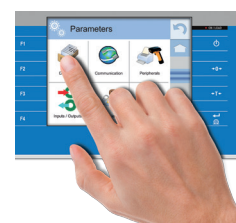
Intuitive operation and touch screen