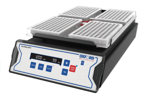
Digital Plate Shaker (S4P-D)