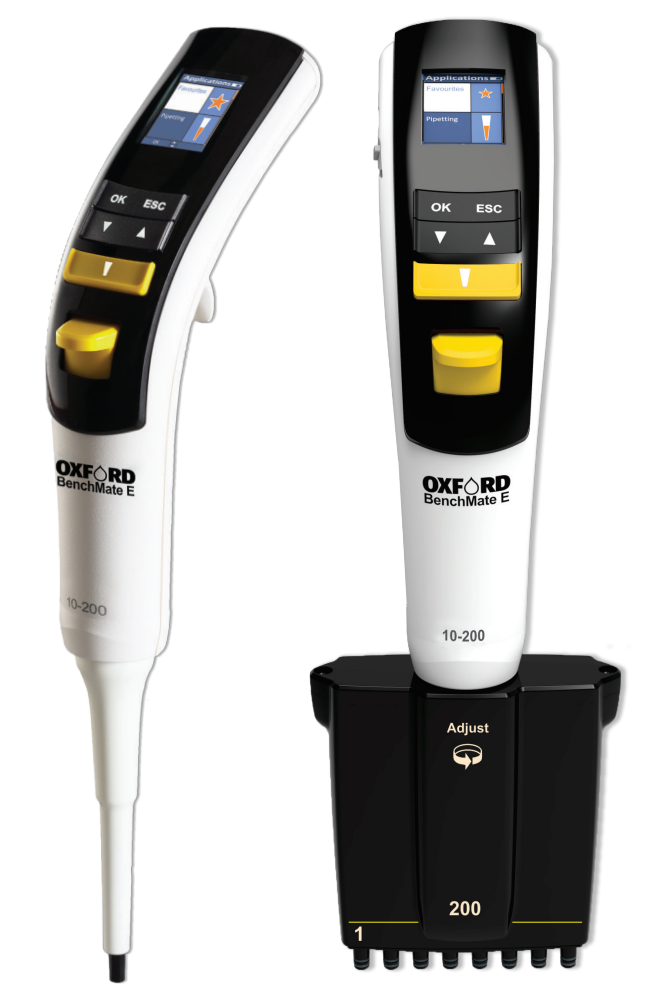
BenchMate® E Single and Multi Channel Electronic Pipettes